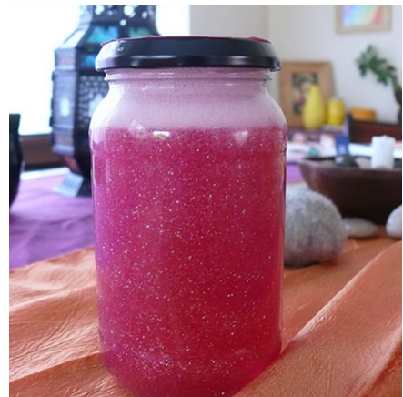
Mind Jar photo from www.herewearetogether.com