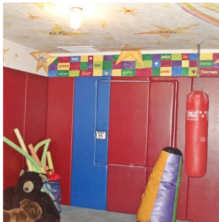
Volcano room photo from www.diaperbank.org

A "Volcano Room" or "Calm Down Box" can help your grieving child deal with complex emotions in a safe and healthy way.